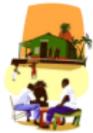
decals for front and back of cooler