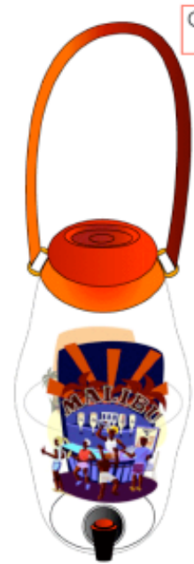
Cooler with colorful designs (evening and afternoon)

This concepts have been presented to Allied Domecq and are all based on promotional ideas that could be packed with the product (Malibu) on shelf; for example, the Flask would be large enough to fit the Malibu bottle inside, and would be clear so that the bottle is visible.