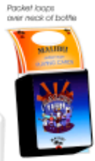
Packet slips over neck of bottle