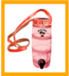
barrel shaped cooler