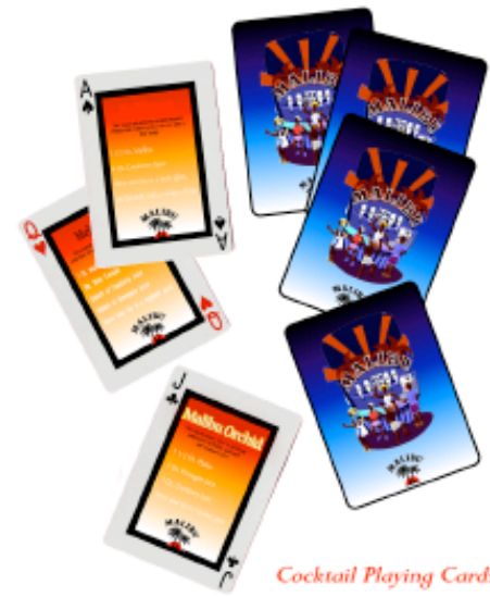
Cocktail Playing Cards