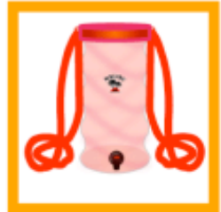
spiral wave shaped cooler